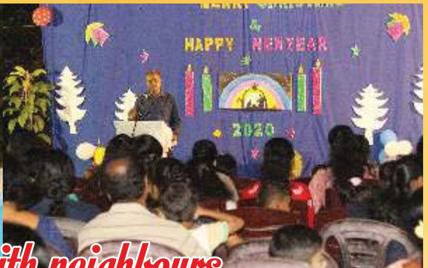
Christmas with neighbours